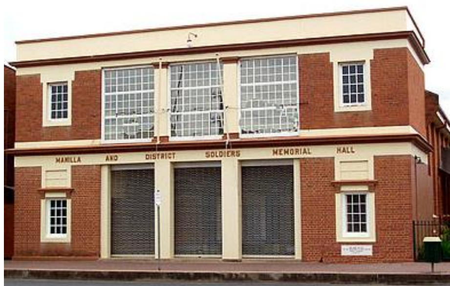
Manilla and District Soldiers Roll of Honour